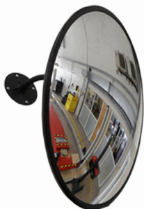
Suitably positioned mirrors or colour camera system for lighting checks (only mandatory for ATL & OPTL installations)