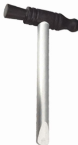
Corrosion assessment tool