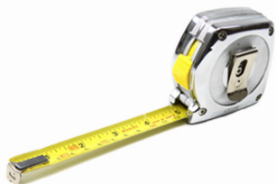
Steel tape measure (min length 1.0m)