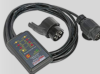
Trailer socket test tool 13 pin